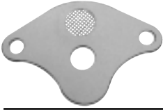
GM 3.8L Linear Part# 2-1379