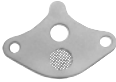
GM Linear Part# 2-1357