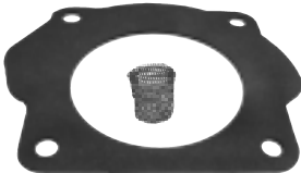
Ford PFE/DPFE Kit Part# 2-1378

#2-1378 • When passages need to be completely cleaned out to restore the EGR system to normal operation, this kit is the same as the #2-1377 but includes the replacement gasket for the intake adapter.