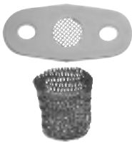
Ford PFE/DPFE with Basket Part# 2-1377

#2-1377 • Includes a KLEAN SCREEN™ BASKET. The BASKET is placed in the tube before the EGR Valve. When used in conjunction with the gasket, gives DOUBLE protection to the passages!