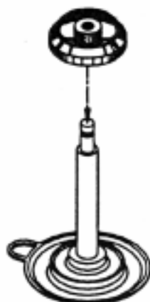
7411 BV Diaphragm

1980 to 1986 Chrysler Corporation and Mitsubishi vehicles with Mikuni-Solex carburetor numbers listed below: