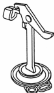
7398 Choke Pull-Off Diaphragm

1980 to 1986 Chrysler Corporation and Mitsubishi vehicles with Mikuni-Solex carburetor numbers listed below: