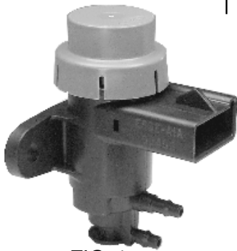
FIG. 1 A complete cross reference from O.E.M. part numbers to Tomco Inc. part numbers begin on page a *New in this Catalog